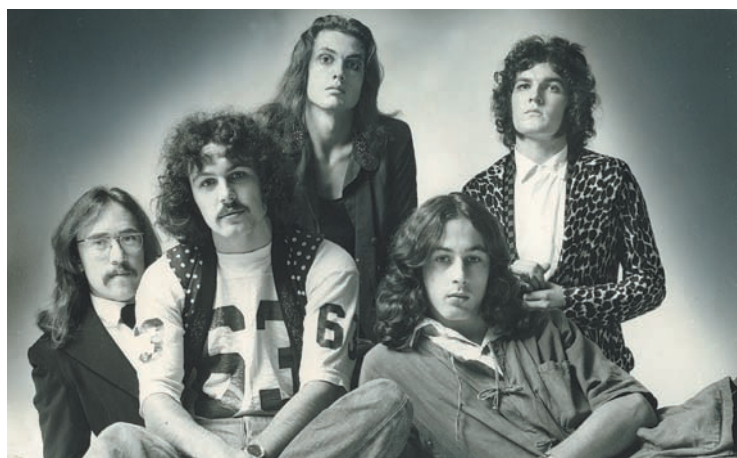
Phil Judd, centre, with Tim Finn, far right, and Split Enz. Above, a self-portrait he gave the Sunday StarTimes of his jail time called Cell 24 . "It was hell. I wouldn't recommend prison to anybody."

PHIL JUDD was indeed "a pop star once", as he boasted to a teenage girl in a drunken, damning Facebook message that blew his life apart at the end of last year.